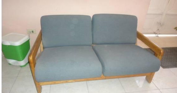
Visitor chair in the office of the church Saint-Louis Montfort