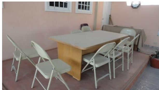
Meeting table in the church