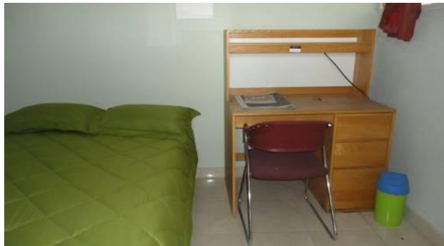
Guest Bedroom at the bishopric