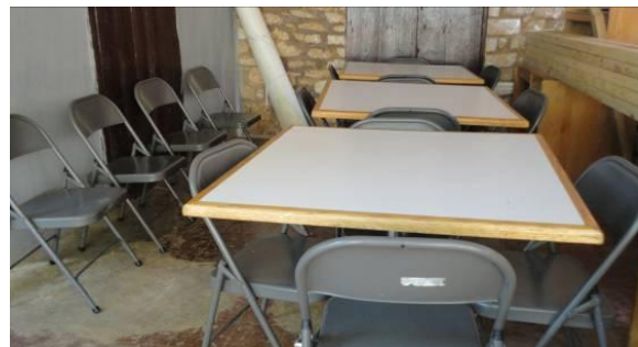
The cafeteria of the orphanage